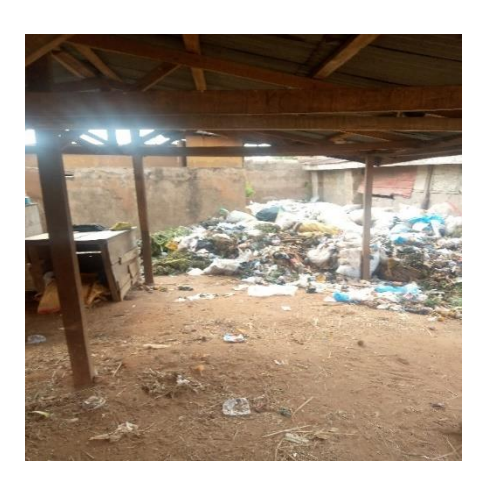
Plate 3: Open dump of waste at Uselu market