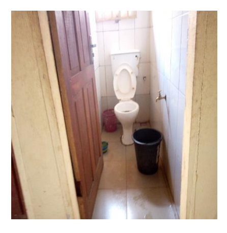
Plate 2: Flush toilet at Uselu market toilet facility