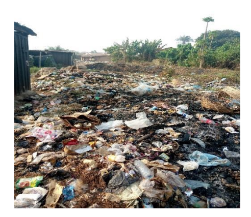
Plate 8: Waste dump in Useh market

Administration of questionnaire: A survey was carried out in the aforementioned markets with the aid of questionnaire to determine the water, sanitation and hygiene (WaSH) status according to WHO/UNICEF (2016). A total of hundred and fifty questionnaires were administered with fifty questionnaires for each market in course of this study.