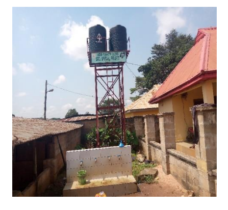
Plate 1: Water source at Uselu market