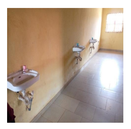
Plate 7: Functioning hand washing stations at Ogida market