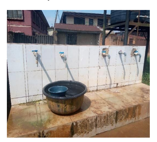
Plate 4: Borehole water source at Ogida market