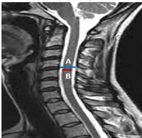
Figure 1. T2-weighted magnetic resonance imaging of the midsagittal cervical spine with illustration of measurements obtained. (SAC=A-B)

Data was analyzed using both inferential