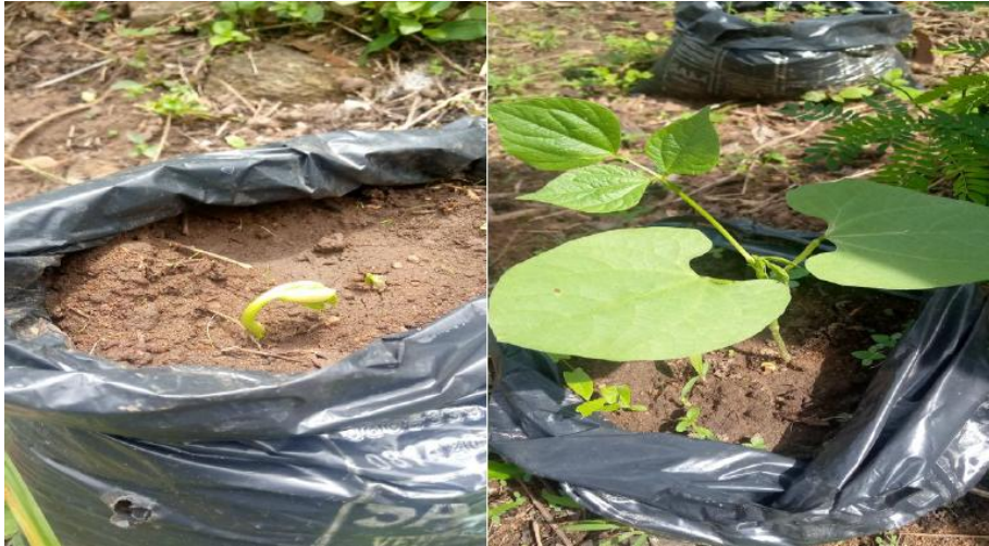
Plate 2: Showing TLn 28 at emergence (3 days after planting) and after 7 days respectively

along the leaf length. Petiole length was determined from the leaf attachment point to the stem, while fresh pod length was assessed as the average length of 20 randomly selected mature pods. Seed dimensions, including length, width, and thickness, were measured from randomly chosen seeds, and the average weight of 100 seeds was recorded. In addition to quantitative measurements, qualitative characteristics were also evaluated. Flower colour was classified as either white or purple, and the shape of leaves was noted as round for all accessions. Pod curvature was assessed on fully expanded immature pods, which could be categorized as straight, slightly curved, or curved. The colour of the mature pods was observed as green when fresh and brown when dried. The number of pods per plant and the number of locules per pod were averaged from 10 randomly selected pods. The shape of seeds was classified as round, oval, or flat.