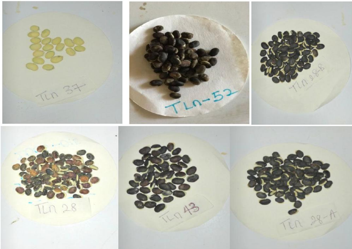
Plate 1: Six out of the 20 accessions of L. purpureus used in this study

cyanide content in the Lablab accessions was performed at Kappa Biotechnology Laboratory, Ibadan. The planting materials consisted of 20 accessions of Lablab purpureus , sourced from the Germplasm Collection of the International Institute of Tropical Agriculture (IITA), Ibadan, Nigeria. The accessions include the six listed in Plate 1, along with TLn 21, TLn 13, TLn 49, TLn 7, TLn 11, TLn 51, TLn 64, TLn 6, TLn 4, TLn 5, TLn 55, TLn 2, and TLn 44.