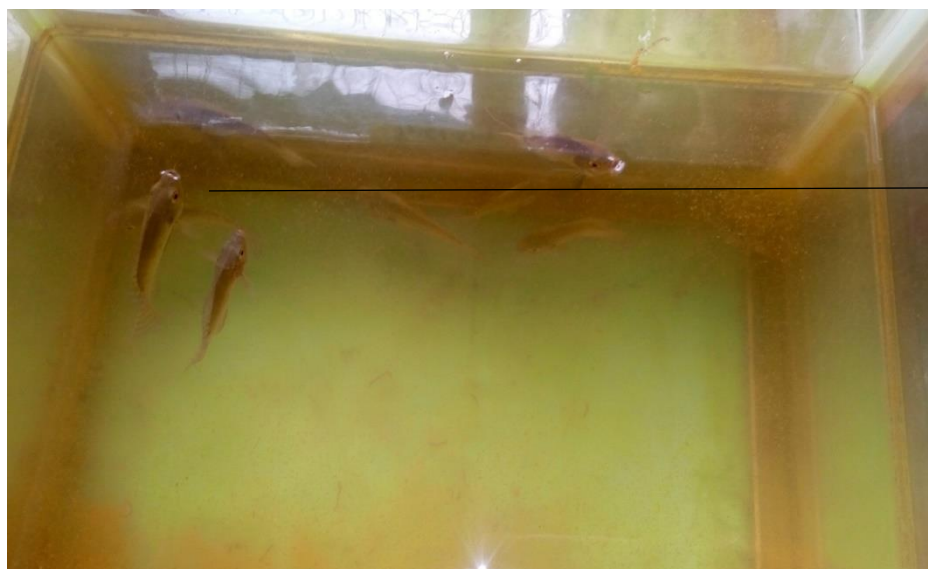
Plate I: Vertical positioning in O. niloticus juveniles exposed to pendimethalin

Behavioural changes were observed in the fishes within the first 12 hours of exposure. Fishes in the three (3) tanks with the highest concentration of pendimethalin (9.0, 8.0 and 7.0 mg/L) showed hyperactivity which was characterized by vertical positioning, fast opening of the operculum, agitated swimming, restlessness, and jumping (Plate I). These behaviours were later shown in fishes in lesser concentrations of the toxicant in a concentration dependent manner from 9-5 mg/L.