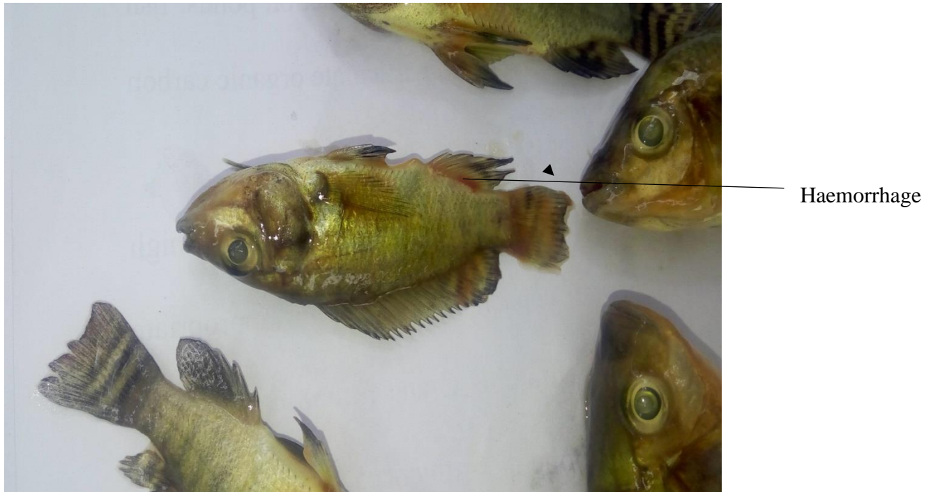
Plate III: Haemorrhage in O. niloticus juveniles exposed to pendimethalin

The results of the acute toxicity bioassay showing the mean mortality, total mortality, percentage mortalities and probit kill values of O. niloticus are presented in Table 1. Mortality was observed in all the treatment groups except the control. The highest mortality of 23 was recorded in the 9 mg/L concentration while the least mortality of 5 was recorded in the 5 mg/L concentration. The percentage mortality of 77% was recorded in the 9 mg/L concentration. The 96-hour median lethal concentration ( LC_{50} ) of pendimethaline for O. niloticus was found to be 6.94mg/L (Figure 1).