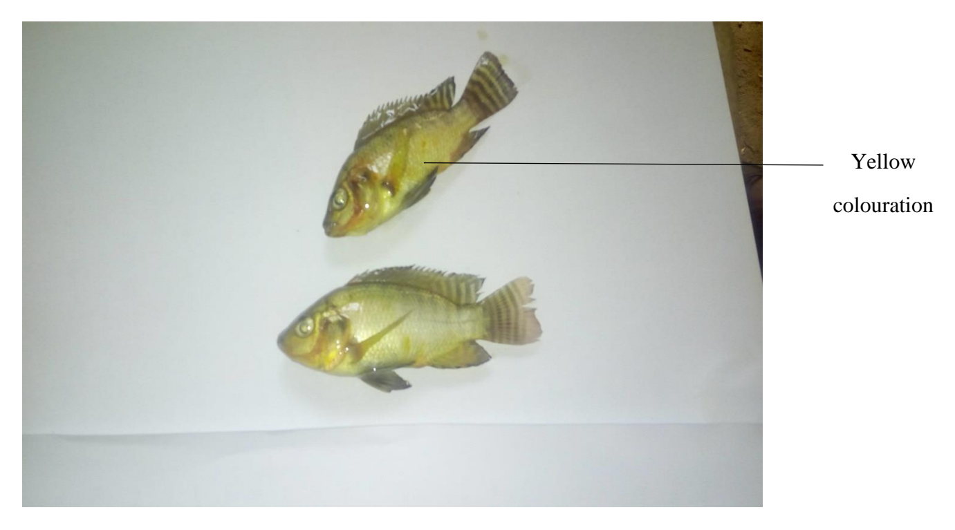
Plate II: Yellow colouration in O. niloticus juveniles exposed to pendimethalin