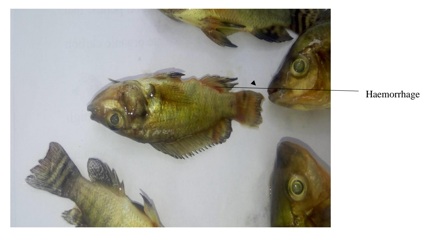
Plate III: Haemorrhage in O. niloticus juveniles exposed to pendimethalin