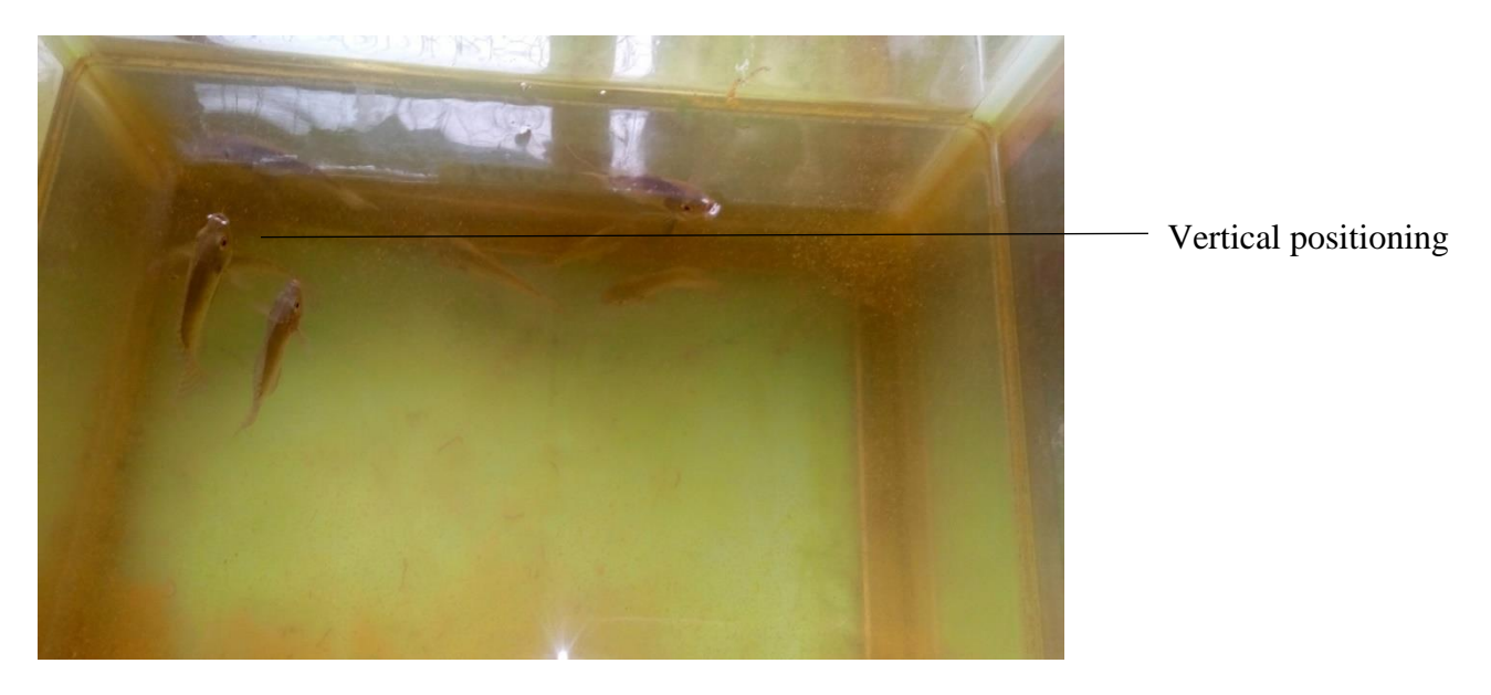
Plate I: Vertical positioning in O. niloticus juveniles exposed to pendimethalin