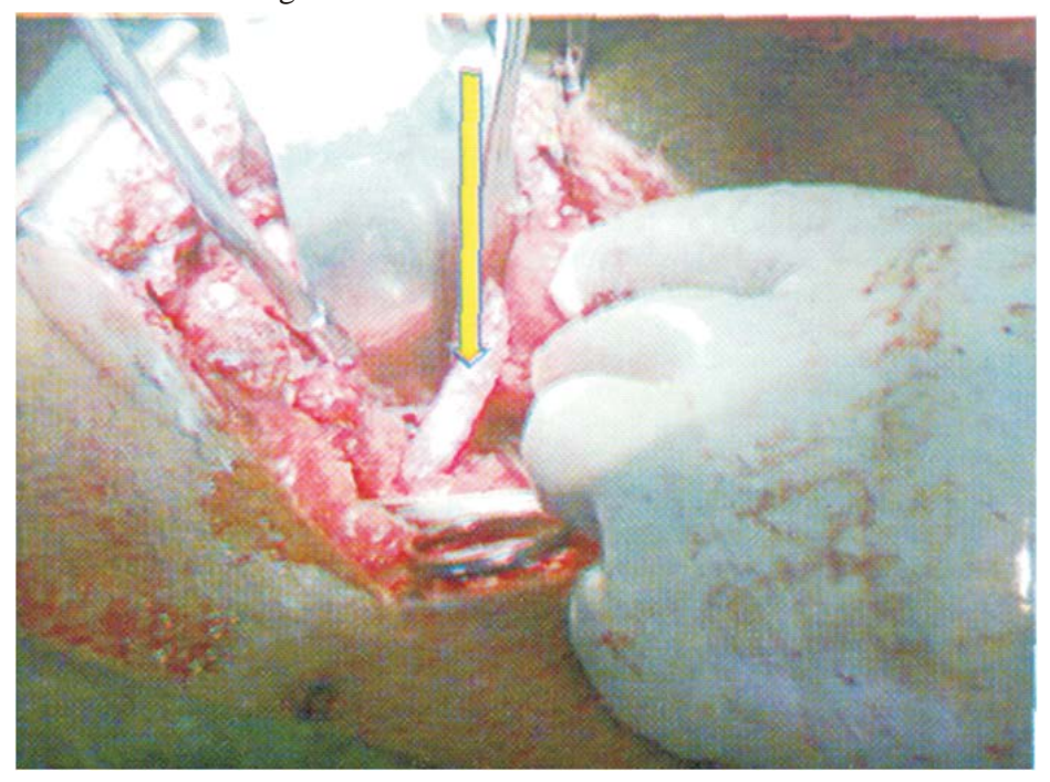
Figure 1: Mobilized left ureter being implanted into the bladder (see arrow above)

Under general anaesthesia and in supine position, routine cleaning and draping was done. Via the previous sub umbilical midline incision access was gained to the pelvis. The right ureter was localised and dissected out at the point of crossing the right external iliac vessels. Ten 10mls of sterile methylene blue dye was injected into the ureter. There was no intraabdominal Extravasation of the dye, but the urine in urethral catheter turned blue. A repeat of the procedure on the left side showed intraabdominal extravasation of the methylene blue dye at the site of damage. Intra-venous injection of 80mg of frusemide also showed the site of injury by spurts of urine in the lower third of the left ureter. The urinary bladder was mobilised and left - ureteroneocystostomy effected using vicryl 3-0 suture and without tension. The ureter was tunnelled below the bladder mucosa to prevent reflux of urine into the neoureter. A stent was passed into the neoureter and brought out separately through the anterior abdominal wall. The bladder wound was closed in two layers. An